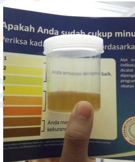
(Gambar 4. Urin Responden)