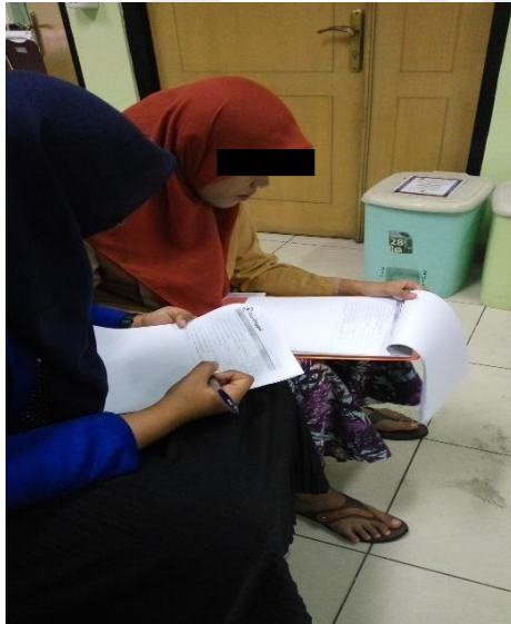
(Gambar 1. Wawancara Responden)