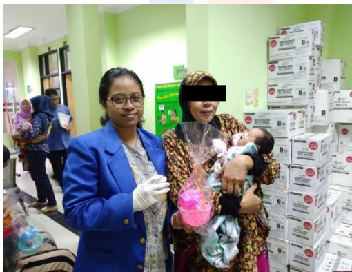
(Gambar 7. Pengembalian Sampel Urin)