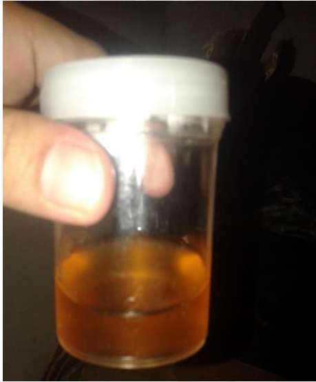
(Gambar 5. Urin Responden)