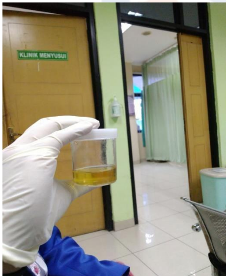
(Gambar 3. Urin Responden)