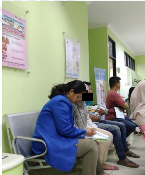
(Gambar 6. Wawancara Responden)