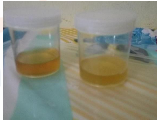
(Gambar 8. Urin Responden)